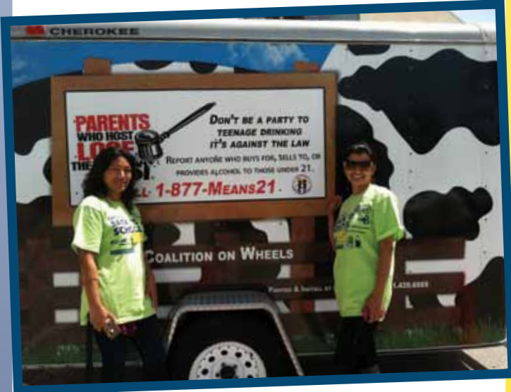
Back to School Bash 2013 volunteers with the COW.

The Coalition on Wheels was created to help with branding, building community relationships and educational information dissemination.