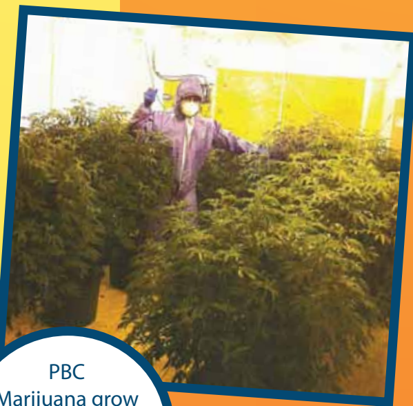
PBC Marijuana grow house being taken down by Sheriffs Department

Promoted the reporting number through various media outlets.